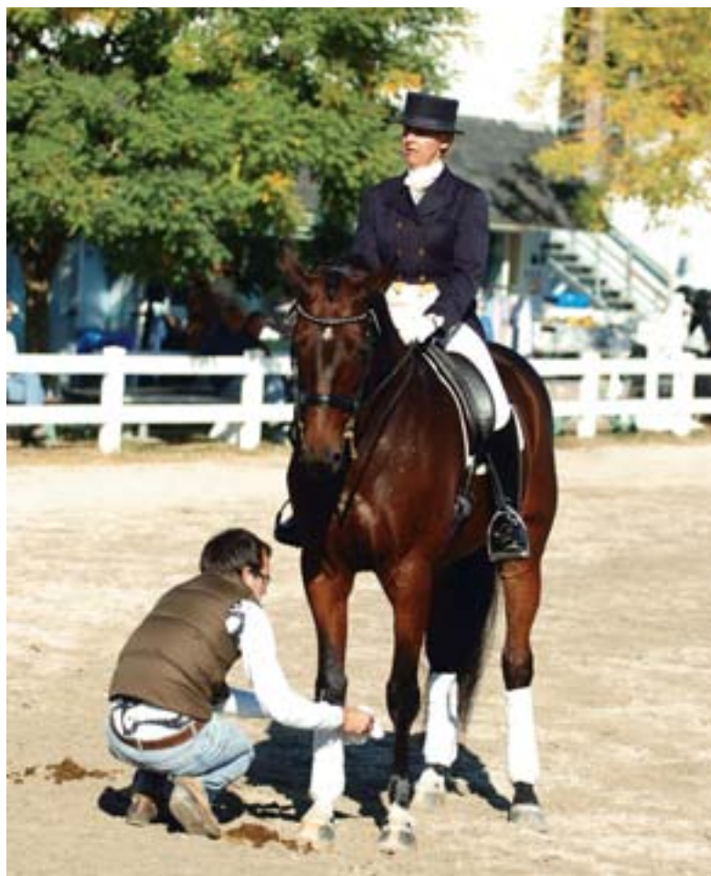
OFF WITH THE WRAPS: Enlist a helper to remove them if you're likely to forget