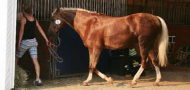
HORSE ID: Horses must wear their competitor numbers at all times when out of the stall